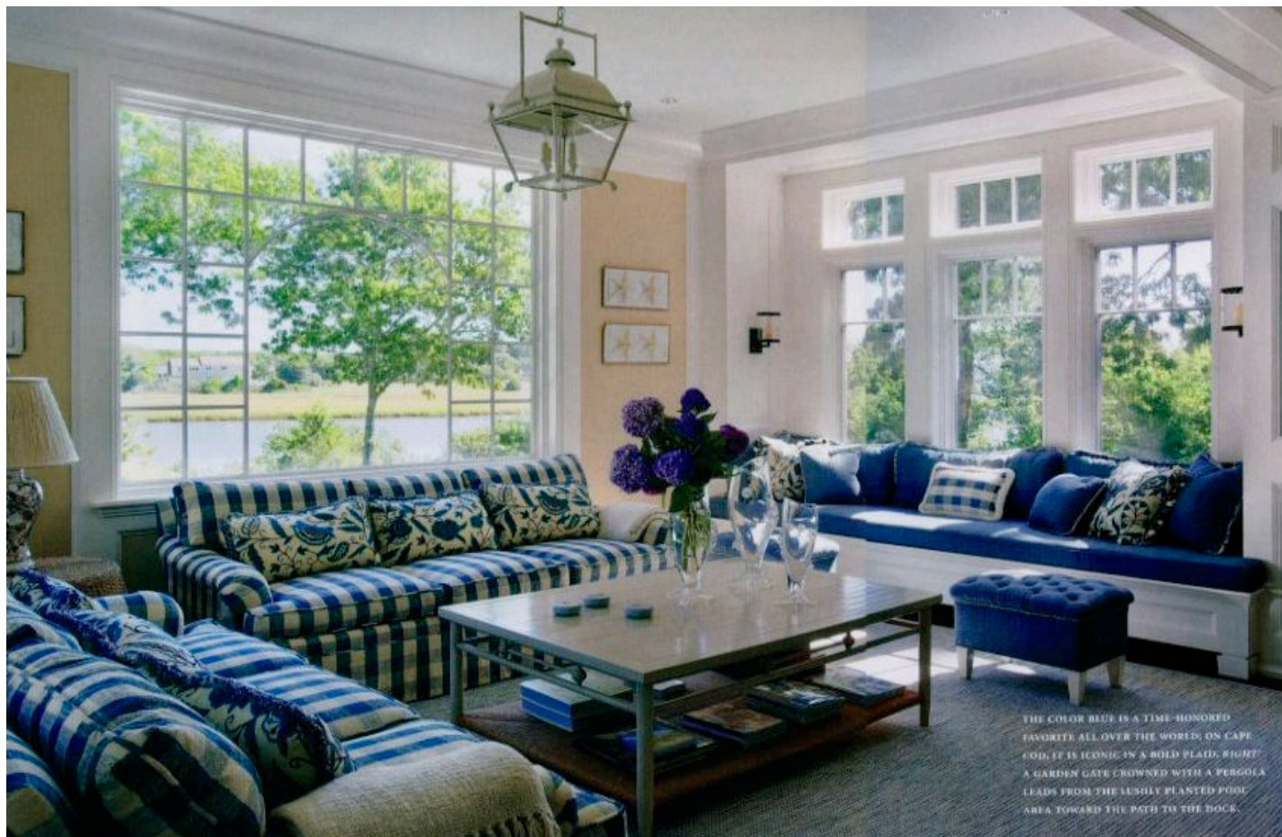
THE COLOR BLUE IS A TIME-HONORED FAVORITE ALL OVER THE WORLD; ON CAPE COD, IT IS ICONIC IN A BOLD PLAID. RIGHT? A GARDEN GATE CROWNED WITH A PERGOLA LEADS FROM THE LUSHLY PLANTED POOL AREA TOWARD THE PATH TO THE DOCK.

fect is charming, classic and as natural as if it had just blown in off the beach. "Blue is the color of Cape Cod," the homeowner says, "and so we created an elegant Cape Cod interior where blue is the dominant color and Cape elements are everywhere."