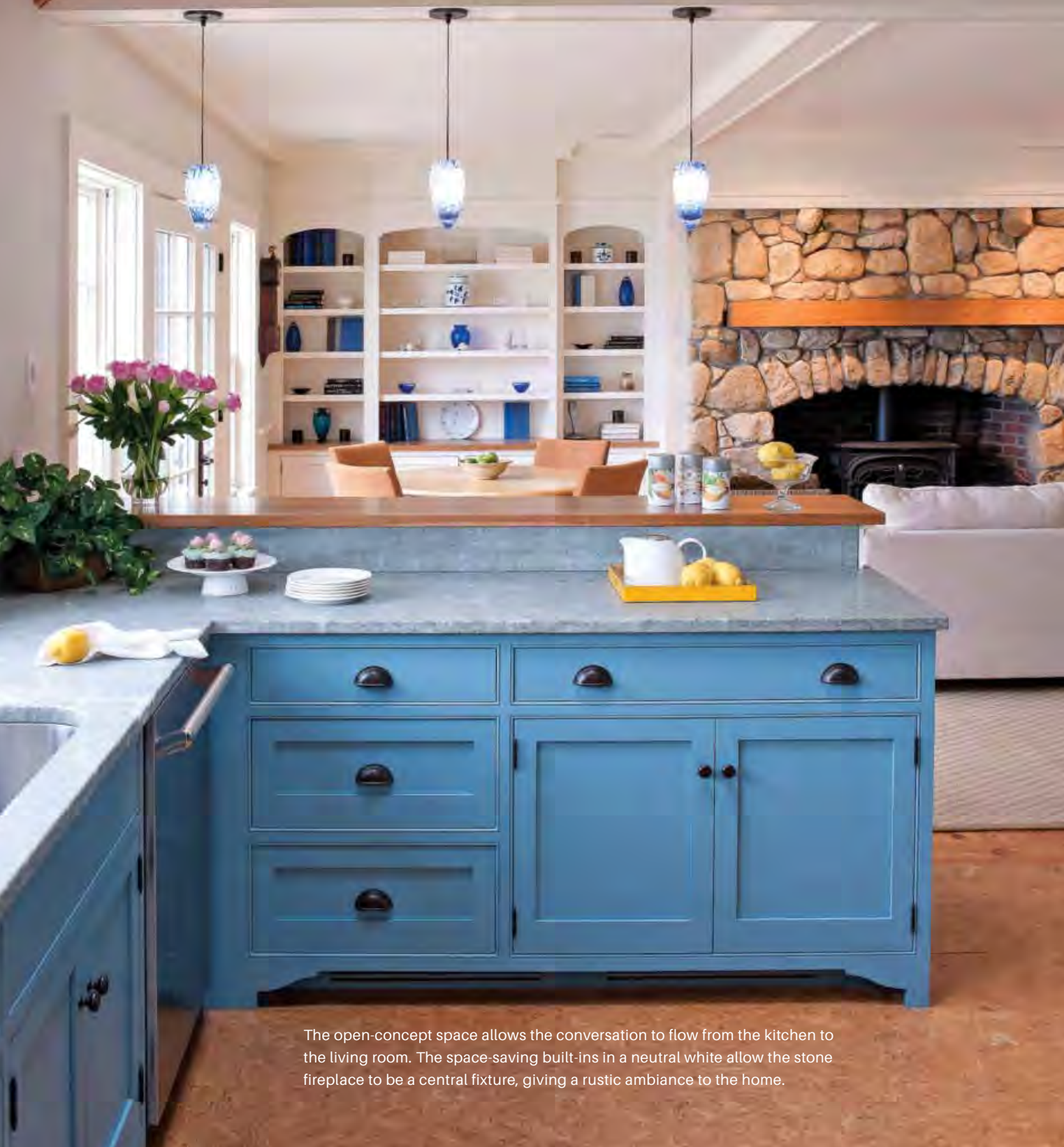
The open-concept space allows the conversation to flow from the kitchen to the living room. The space-saving built-ins in a neutral white allow the stone fireplace to be a central fixture, giving a rustic ambiance to the home.

“Overall, we wanted the space to be bright, beachy and cheerful, and the custom cabinetry and built-ins throughout the house really help to achieve this.”