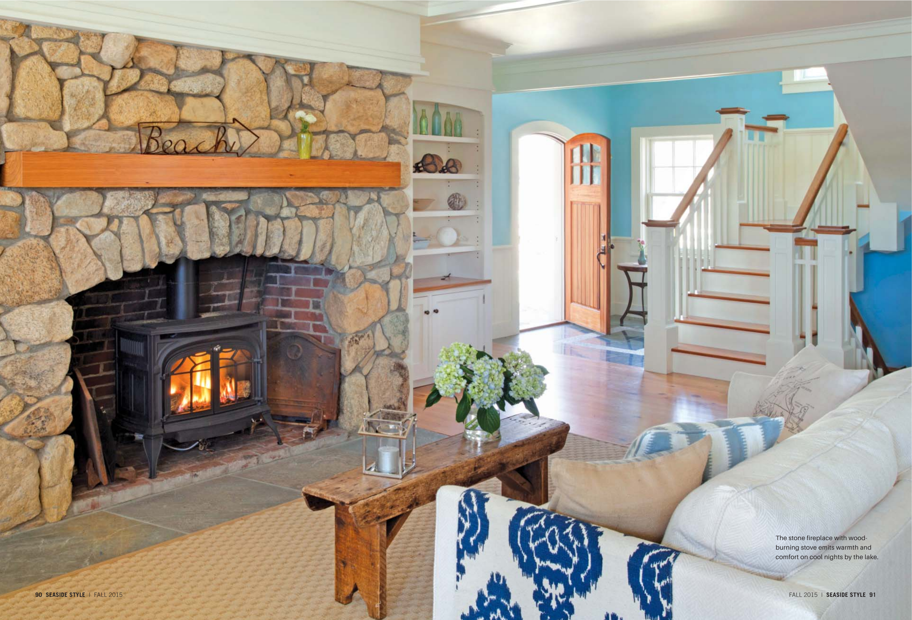
The stone fireplace with wood-burning stove emits warmth and comfort on cool nights by the lake.