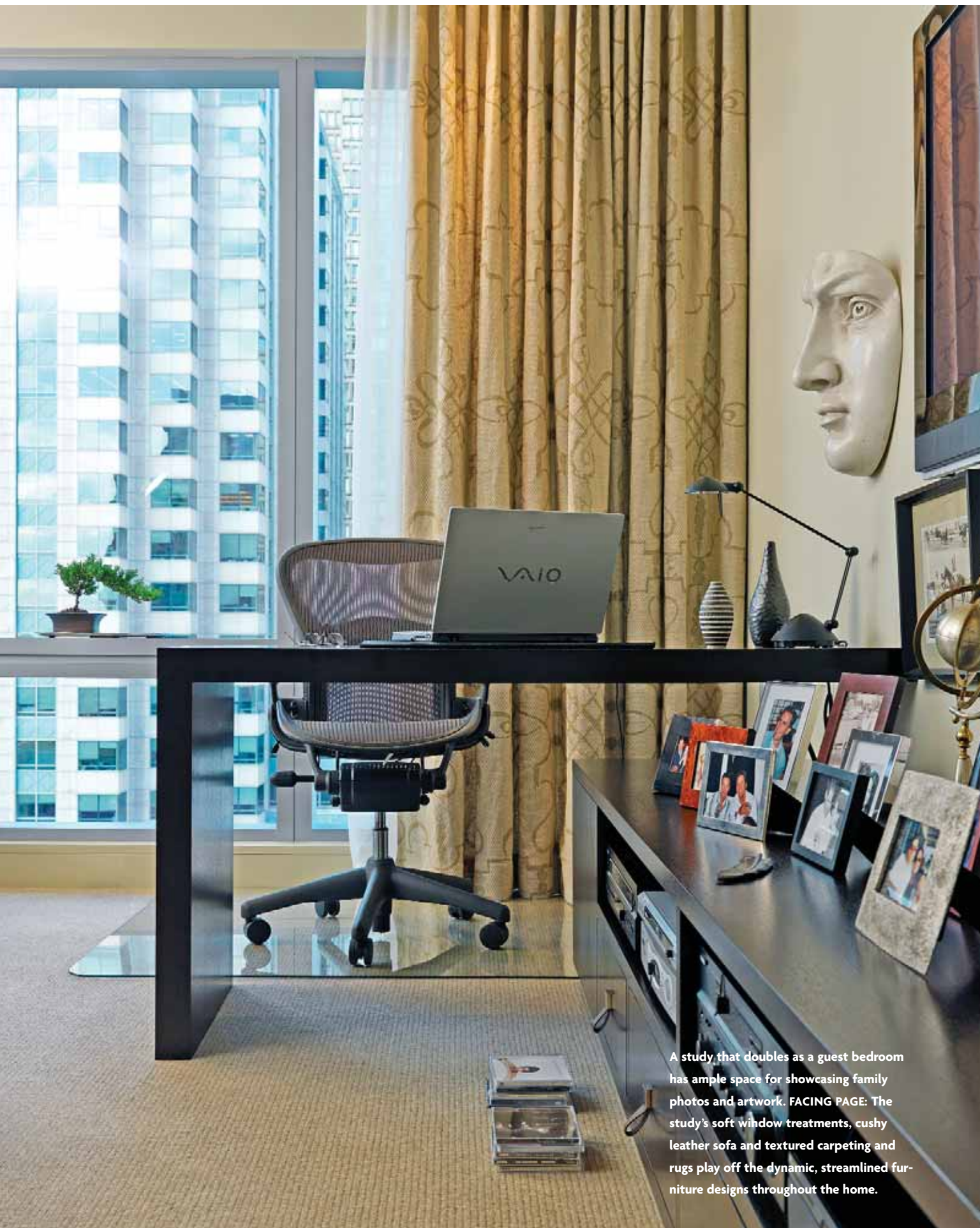
A study that doubles as a guest bedroom has ample space for showcasing family photos and artwork. FACING PAGE: The study's soft window treatments, cushy leather sofa and textured carpeting and rugs play off the dynamic, streamlined furniture designs throughout the home.