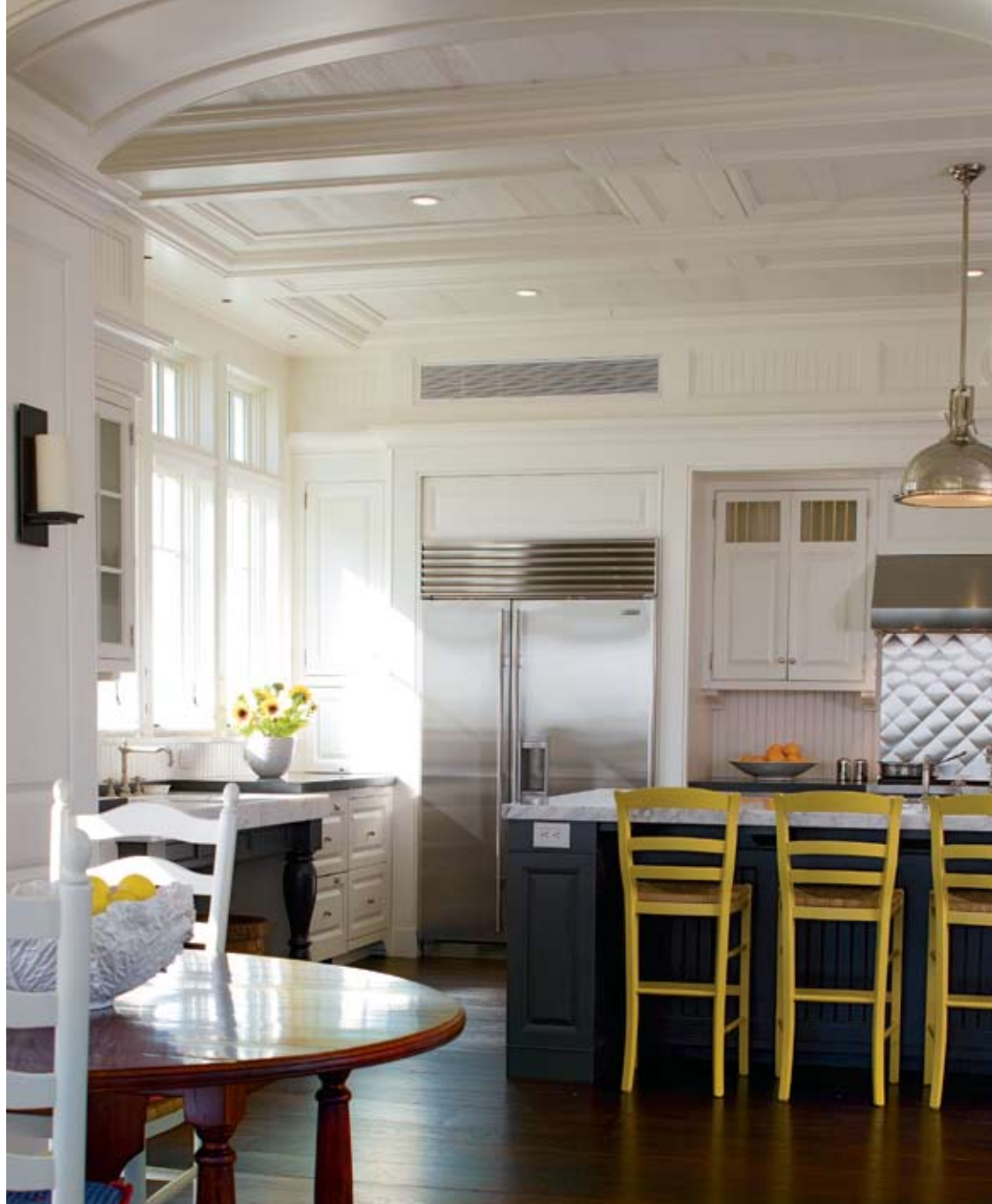
THE WALLS IN THE sitting room (FACING PAGE) are painted bright white, and the seating area, furnished with rattan finished with colorful cushions, clusters around a put-your-feet-up lacquered-linen coffee table. The kitchen (ABOVE) features such classic elements as painted paneled cabinetry and a coffered ceiling. A quilted stainless-steel backsplash behind the cooktop adds texture and the bright yellow chairs at the oversize island bring a spirit of conviviality.